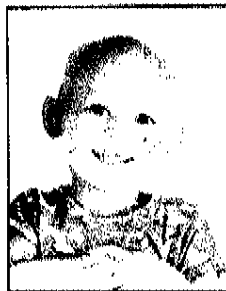
Hazel brain cancer